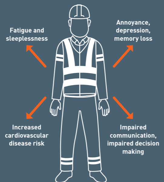
NON-AUDITORY EFFECTS OF NOISE EXPOSURE

Noise exposure can also cause a number of non-auditory health effects as described in the diagram opposite.