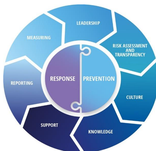
Figure 1: Workplace prevention and response framework to address sexual harassment 10

Companies contributing to this submission employ people who work in Perth, on site or remote/mobile work settings across residential-based, FIFO and DIDO workforce arrangements. Work environments range from traditional offices, on site semi-industrial offices, working from home arrangements, plants and heavy industry, exploration and surveying, amongst others. Work localities vary from city, suburban, regional and remote areas, as dictated by the diverse nature of the resource sector. Health, hygiene, safety and geological features necessitate commodity, exploration, extraction and processing is generally conducted away from populous areas. With Australia's majority population located in coastal urban and suburban locals, and most asset recovery occurring in regional, rural and remote areas, significant worker commuting is a natural consequence. FIFO arrangements enable safe and large-scale transport of workers to these areas and therefore represent a significant proportion of the WA resources sector people engagement model. Extrapolating from member survey data we received last year, CME estimates there is more than 50,000 employees and contractors whom FIFO predominately from within the state, with a smaller proportion of interstate or overseas mobility (in non-impacted COVID times).