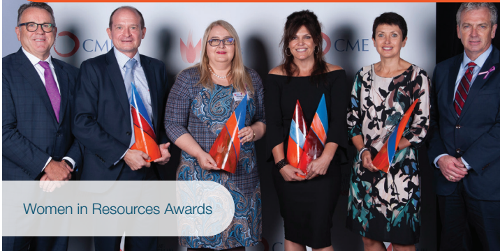
Women in Resources Awards