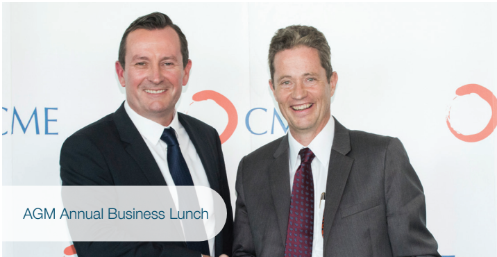
AGM Annual Business Lunch