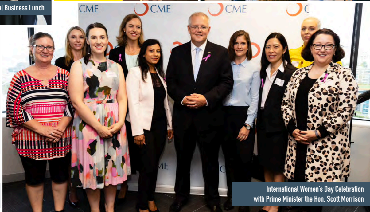
International Women's Day Celebration with Prime Minister the Hon. Scott Morrison