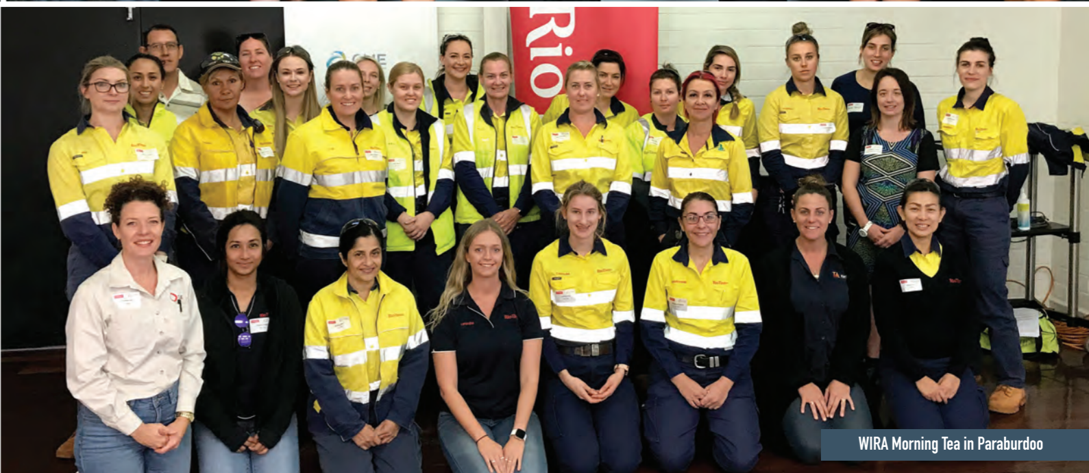
WIRA Morning Tea in Paraburdoo