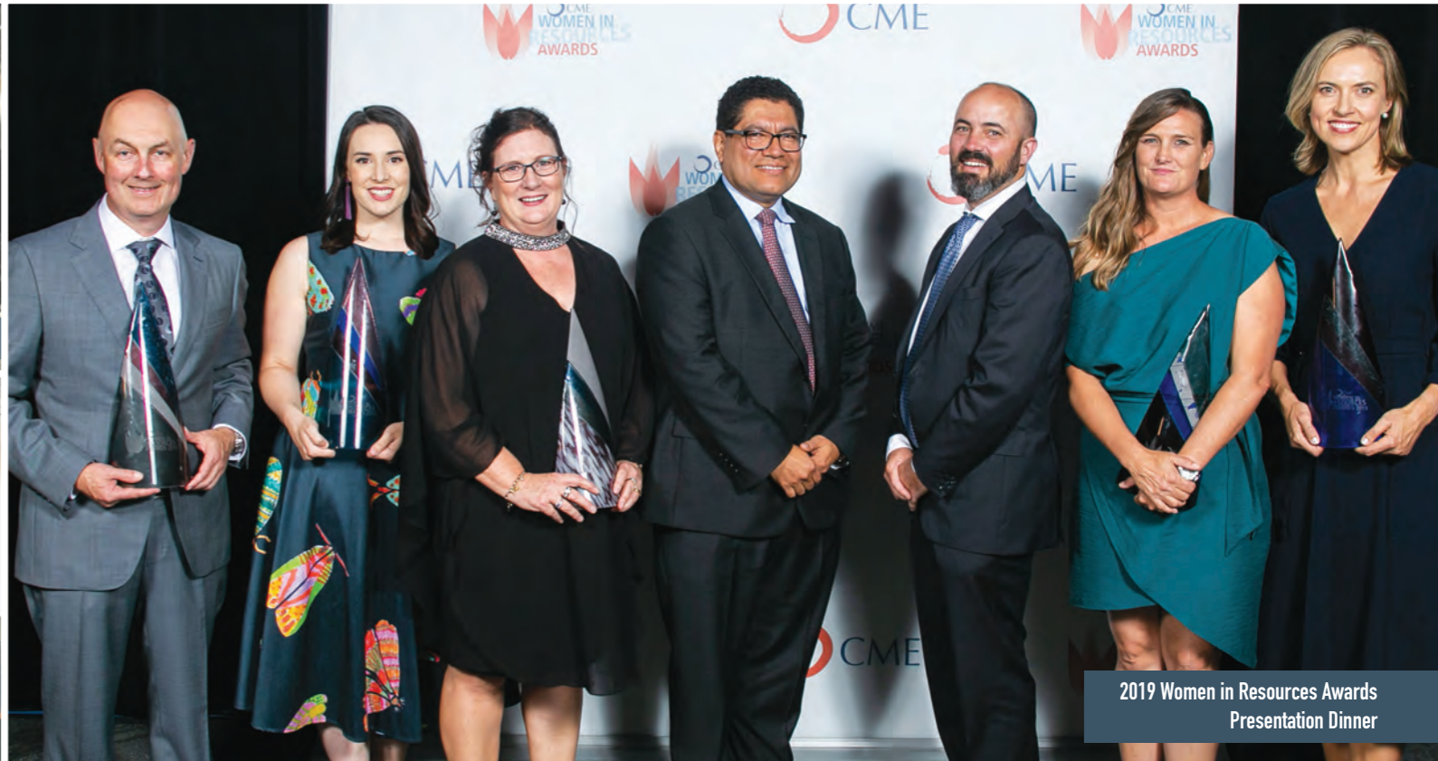
2019 Women in Resources Awards Presentation Dinner