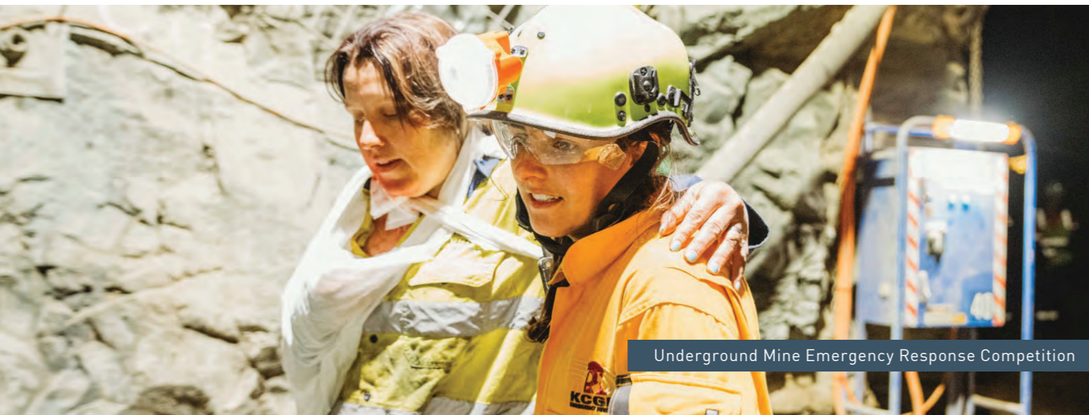
Underground Mine Emergency Response Competition