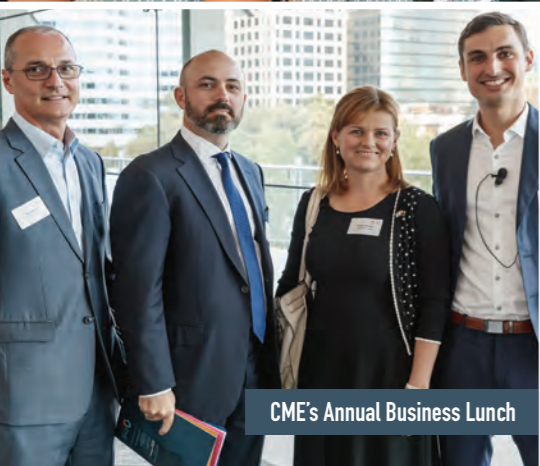
CME's Annual Business Lunch