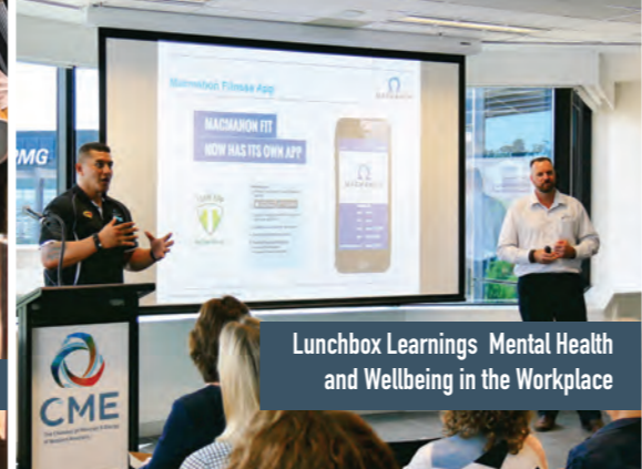
Lunchbox Learnings Mental Health and Wellbeing in the Workplace