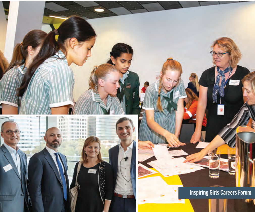
Inspiring Girls Careers Forum